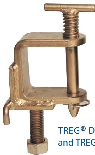
TREG ® Detachable "U" (3/4") 3.0 T (TREG5004A) and TREG ® Spring Pin (3/4") 3.0 T (TREG5007A)

The TREG Poly Block Coupling ® was first designed and manufactured over 50 years ago. Since then it has been continuously refined and improved.