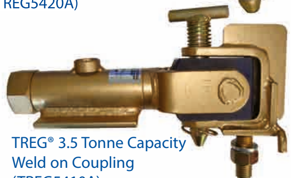
TREG® 3.5 Tonne Capacity Weld on Coupling (TREG5410A)

®TREG Poly Block coupling is a registered trademark