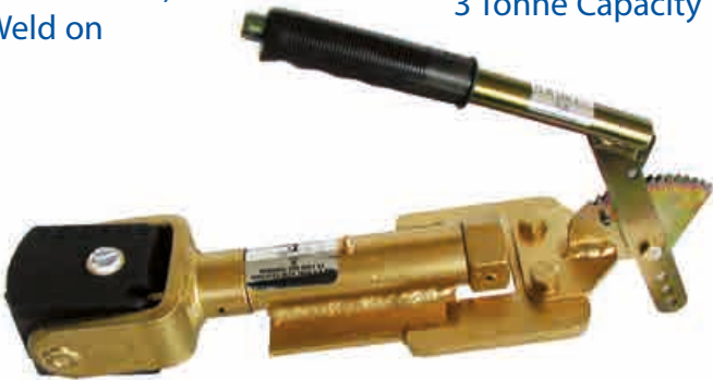
TREG® Hand Braked/Electric Coupling

G.J. TREGONING PTY. LTD. TREG TRAILERS PTY. LTD.