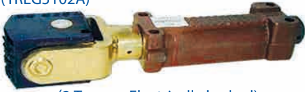
3 TONNE UNSPRUNG (TREG5102A)

(3 Tonne - Electrically braked) TREG® Override body (Also available with handbrake)