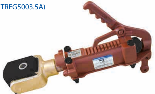
TREG® (2 Tonne) Mechanical Override