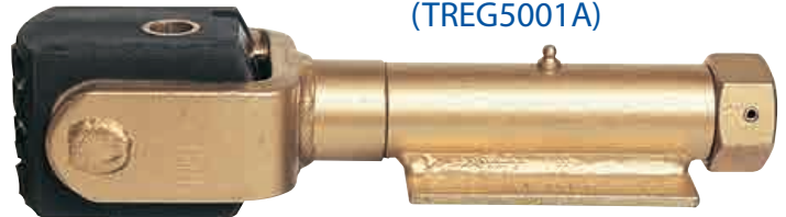
3 Tonne Capacity (Also available in 3.5 tonne capacity)